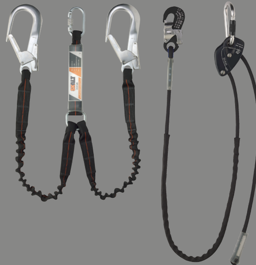
fall rav double