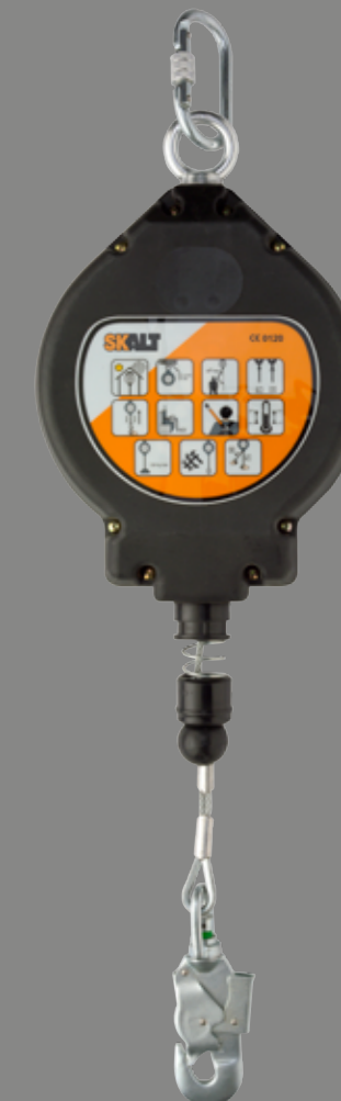
prostop 10, 15, 20 and 25