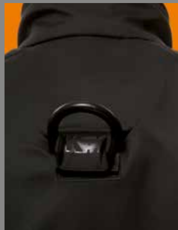
Outside back D-ring