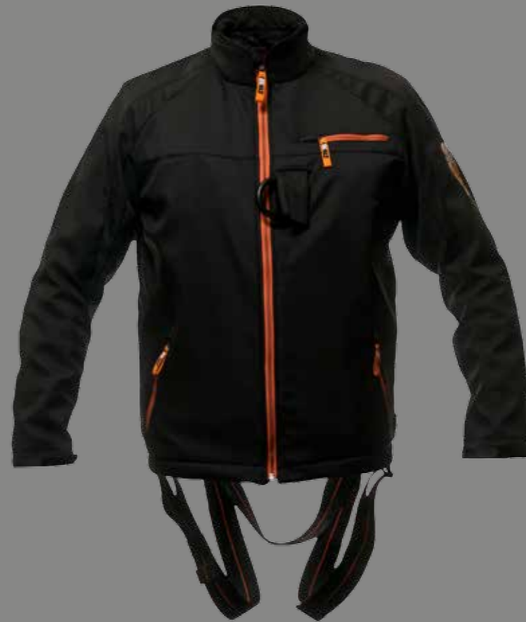
Harness and frontside D-ring